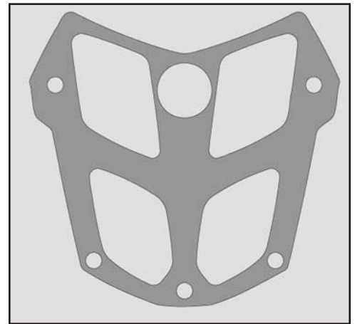
REAR RACK KIT Z8911