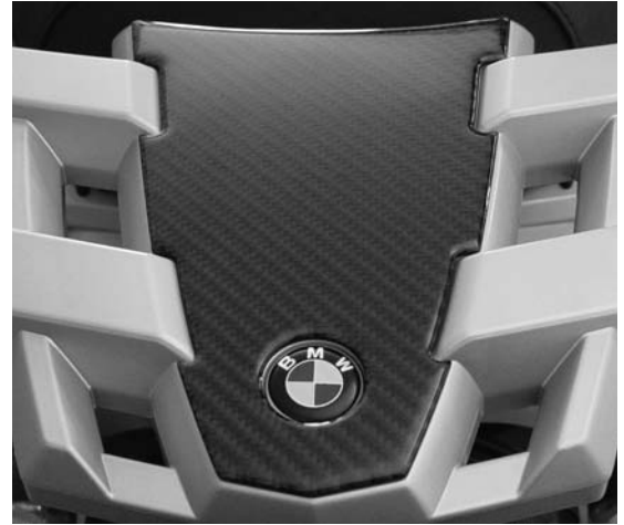
REAR RACK KIT Z8941