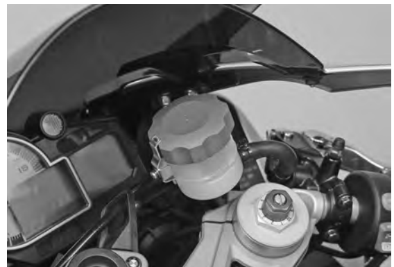
ZCap, Brake Reservoir Replacement Cap, Machined Aluminum Fits: S1000 RR

BMW TOOL REQUIRED BMW Tool, 321 510/511 Clutch Reservoir and Brake Reservoir Cap removal tool.