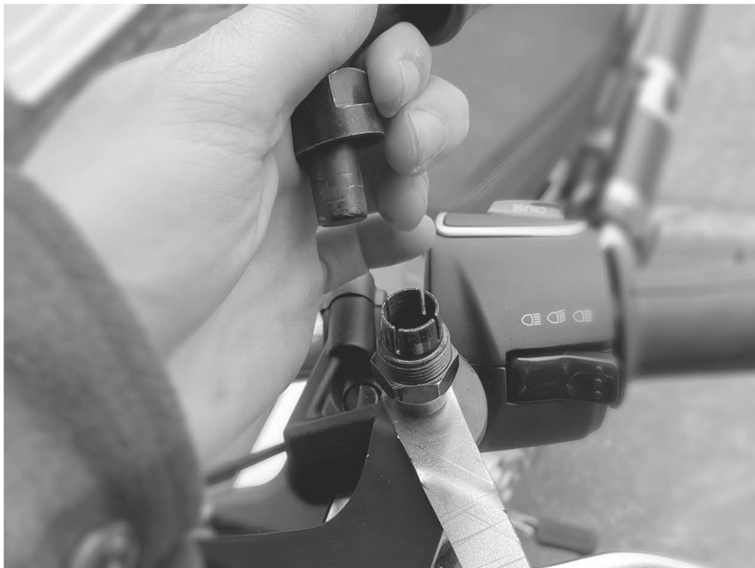
Fitting sequence for reassembly of the mirror mounting